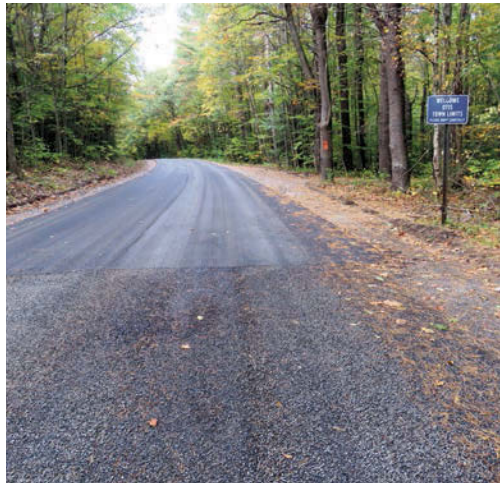
A smoother Cold Spring Road, but gravel and tar are a problem, especially for walkers.

Residents were surprised to see that the Otis section was repaved with asphalt while the entire Sandisfield section was chipsealed. I understand that Otis paid for the asphalt possibly entirely or maybe they covered the difference. If the latter is the case, or even if it is not, and the $180,000 Sandisfield savings figure is accurate (seems low to me), the question